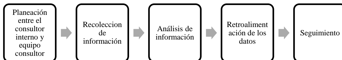
Figura 1. Diagnóstico de ciclo continuo

For this reason, the method applied for the present study was the organizational development model of the continuous cycle proposed by Nadler. This allows the diagnosis to be carried out efficiently because it involves all the stages necessary for a correct process of organizational intervention, which includes not only the planning and compilation of the information, but also the follow-up (figure 1).